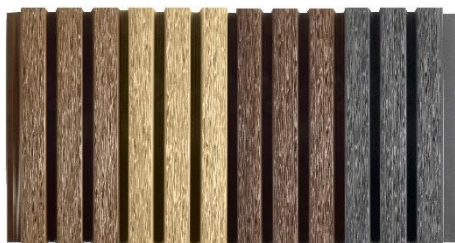
Teak Cedar Ipe Dark Grey

The product is a wood plastic composite with intended application as interior and exterior closed cladding.